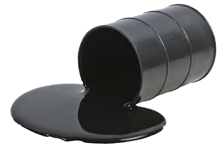
Don't throw oil away in the garbage and allow it to harm the environment!